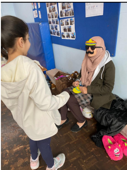
Picture: Free play session at Seven Up Chance to Play club